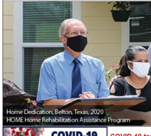
Home Dedication, Belton, Texas, 2020 HOME Home Rehabilitation Assistance Program